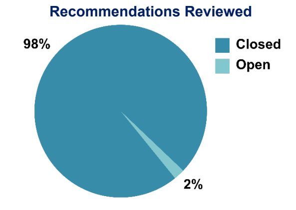
Exhibit 2 - Overall Status of

action is required by management to sufficiently address the risk/issue identified.